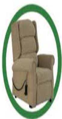
Rise & Recline Chairs