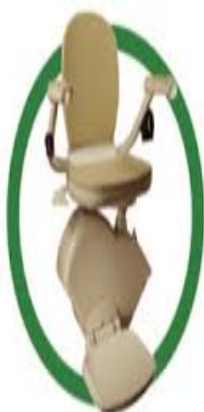
Stair Lifts & Bath Lifts