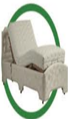
Custom Made Adjustable Beds