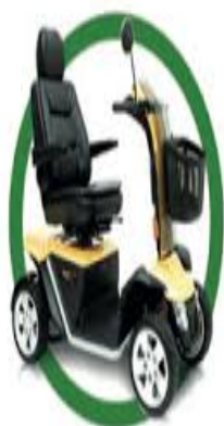
Scooters & Wheelchairs