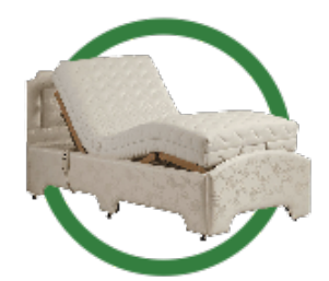
Custom Made Adjustable Beds

Call Vr On 24hrs Answer-phone 01263588777