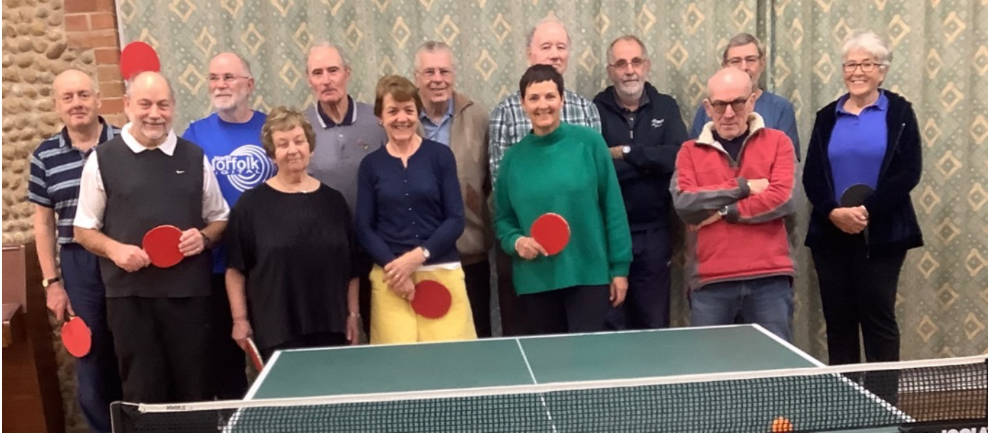
The competitors . . . before battle commenced

The inaugural David Buckley Cup singles tournament took place on Friday 24 November 2023.