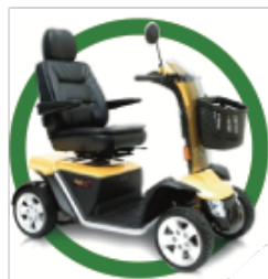
Scooters & Wheelchairs