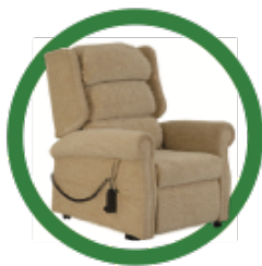
Rise & Recline Chairs