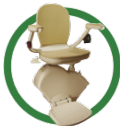
Stair Lifts & Bath Lifts