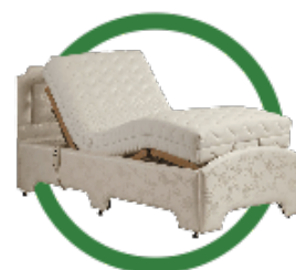
Custom Made Adjustable Beds

Call Us On 24hrs Answer-phone 01263588777