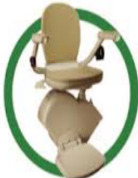
Stair Lifts & Bath Lifts