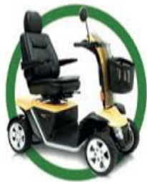
Scooters & Wheelchairs