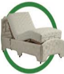
Custom Made Adjustable Beds