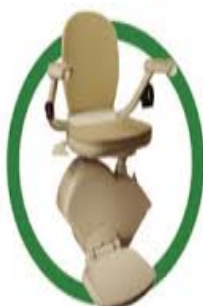
Stair Lifts & Bath Lifts