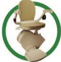
Stair Lifts & Bath Lifts