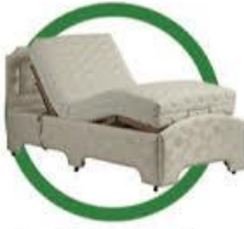
Custom Made Adjustable Beds