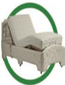
Custom Made Adjustable Beds