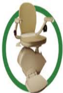
Stair Lifts & Bath Lifts