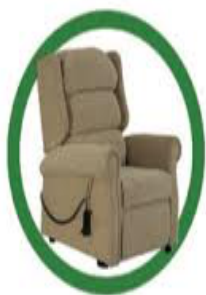
Rise & Recline Chairs