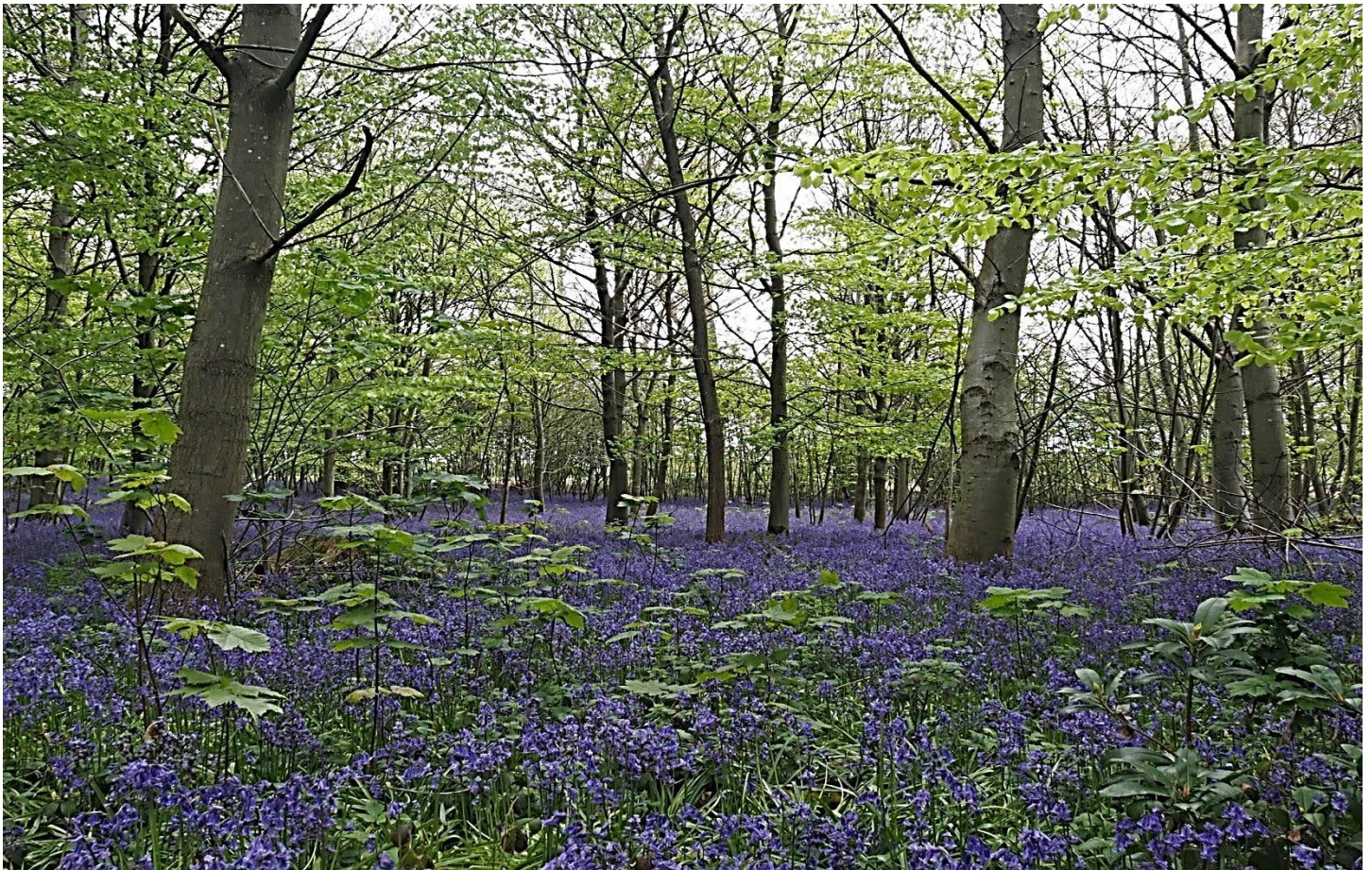
Great Wood, Blickling Hall

An information newsletter by the High Kelling Parish Council and Trustees of the Village Hall for all residents of High Kelling