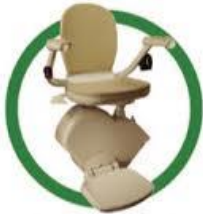
Stair Lifts & Bath Lifts