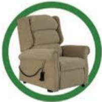
Rise & Recline Chairs