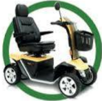
Scooters & Wheelchairs