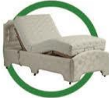
Custom Made Adjustable Beds