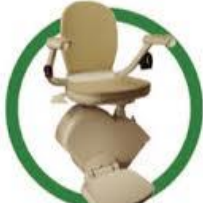
Stair Lifts & Bath Lifts