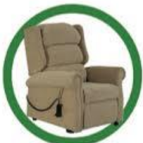
Rise & Recline Chairs