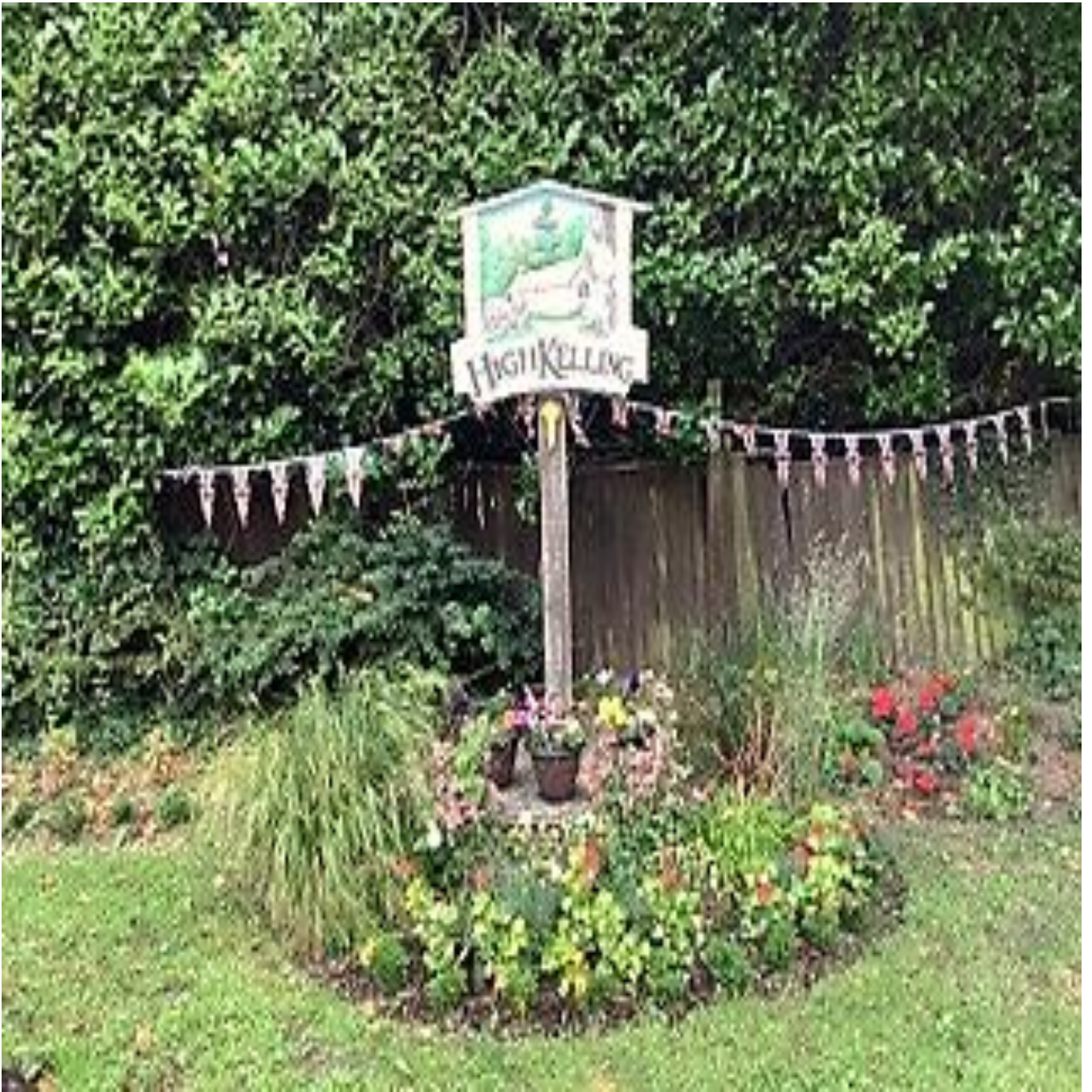
The village sign planting to commemorate the Queen's Platinum Jubilee