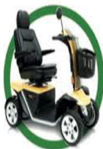
Scooters & Wheelchairs