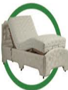
Custom Made Adjustable Beds