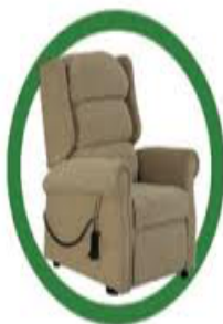
Rise & Recline Chairs