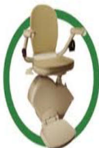
Stair Lifts & Bath Lifts