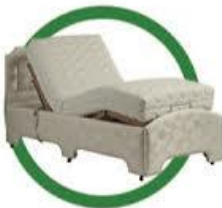
Custom Made Adjustable Beds