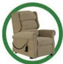
Rise & Recline Chairs