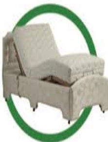
Custom Made Adjustable Beds