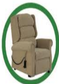
Rise & Recline Chairs