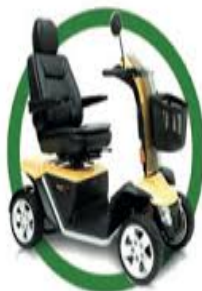
Scooters & Wheelchairs