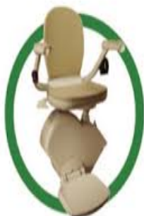
Stair Lifts & Bath Lifts