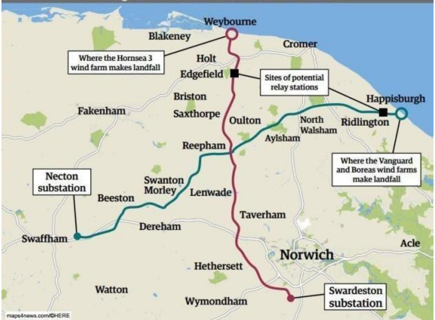
Fig 1. Hornsea 3, Norfolk Vanguard and Boreas Routings

application until Summer 2022 to allow them more time for consultation and refinement. This is the least mature of the above developments and yet another that will make landfall at Weybourne; Muckleborough, to be precise. From there it will run south east under Weybourne Woods crossing the A148 east of Bodham and then south past Saxthorpe to the National Grid connection point near Swardeston, south of Norwich, taking a similar route to Hornsea Project 3. There was a concern earlier in the consultation that the cable route could run much closer to High Kelling but following submissions from your Parish Council, the final route chosen moved eastwards as described. We are currently awaiting notification of further local meetings.