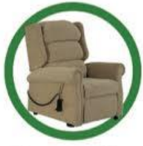
Rise & Recline Chairs