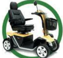
Scooters & Wheelchairs